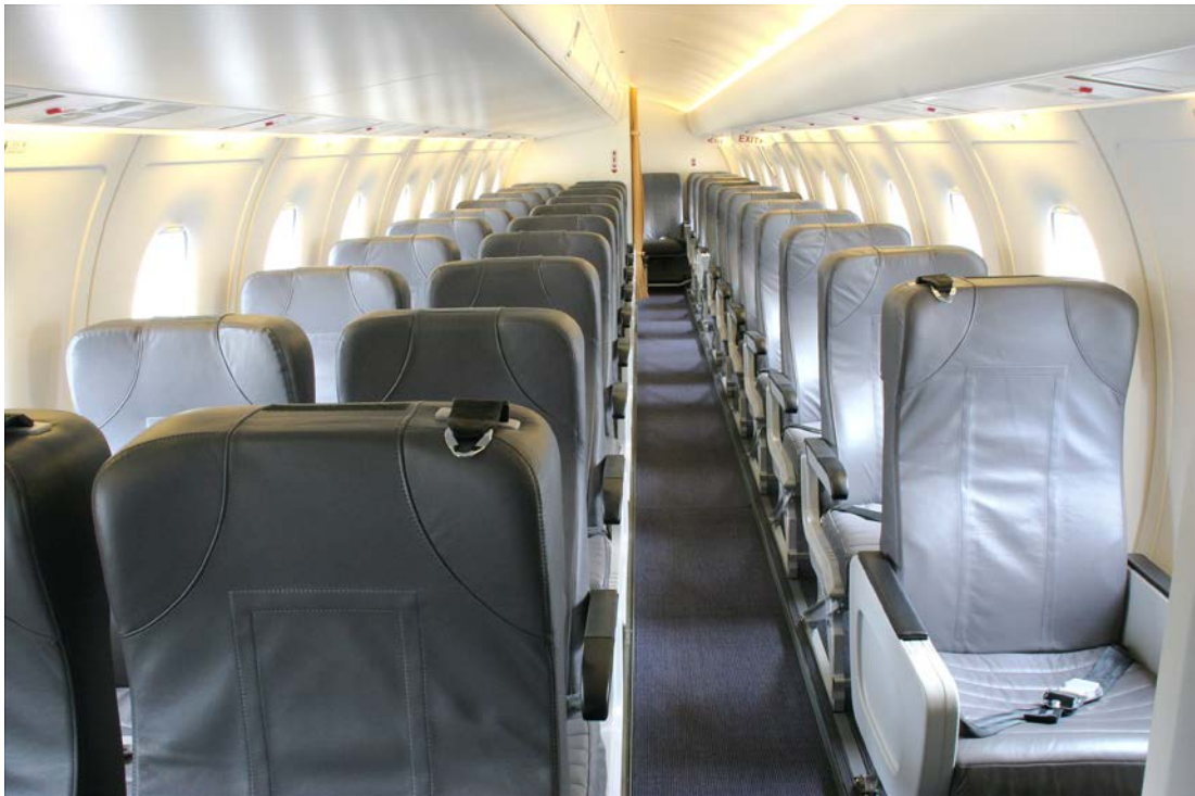
Seats are actually blue

Details believed to be correct but not guaranteed; to be verified on inspection.